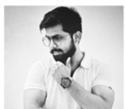
UX/UI Designer | Salary 1,80,000 p.a