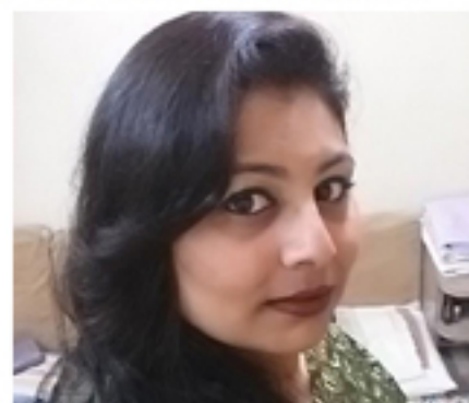
UX/UI Designer | Salary: 5,80,000 p.a