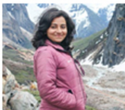
UX/UI Designer | Salary 3,60,000 p.a