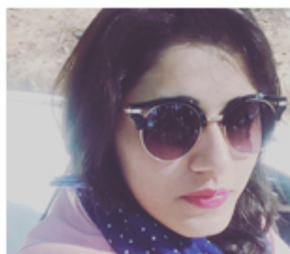
UX/UI Designer | Salary: 3,60,000 p.a