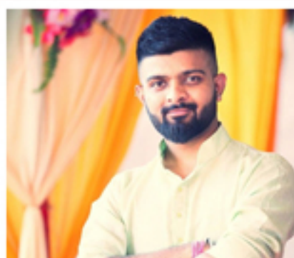
UX/UI Designer | Salary: 3,00,000 p.a