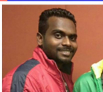
UX/UI Designer | Salary: 5,80,000 p.a