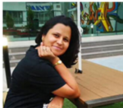
Web Designer | Salary 6,00,000 p.a