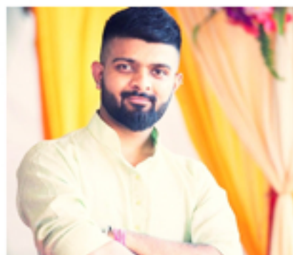
UX/UI Designer | Salary: 3,00,000 p.a