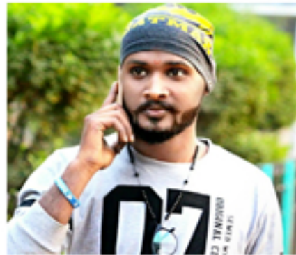
Graphic Designer | Salary: 1,80,000 p.a