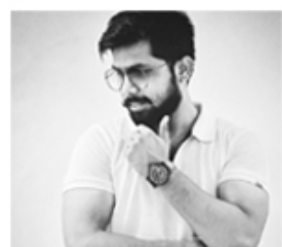
UX/UI Designer | Salary 1,80,000 p.a