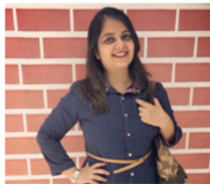
Web Designer | Salary 3,50,000 p.a