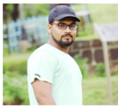
Graphic Designer | Salary: 3,60,000 p.a